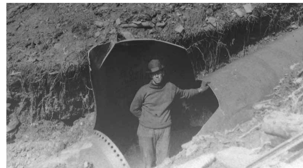
A broken section of Yukon Ditch pipe.

The Yukon Ditch — as it became known — was an enormous undertaking, requiring large amounts of capital as well as able engineering and management. The system included 61 km of ditch, 31 km of wooden flume and 20 km of pipe. With a drop in elevation of almost 350 metres over its course, it used gravity alone to transport the water. Water pressure at the Klondike River was close to 500 pounds per square inch.