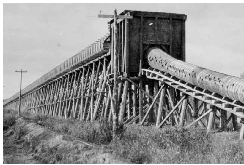
Flume, pressure box and wood stave siphon.