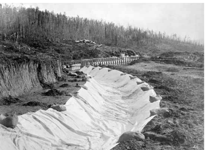
A canvas-lined section of the ditch, near Cripple Creek, 1909.

In the early 20th century, mining promoter A.N.C. Treadgold devised a plan to bring water to the Klondike from the head of the Twelve Mile River, 112 km away. The intensive large-scale mining that had started to transform Klondike gold mining required huge amounts of water.