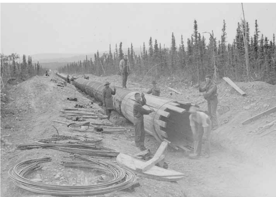
Assembling redwood-stave pipe, 1907. Dawson City Museum 1984.234.99